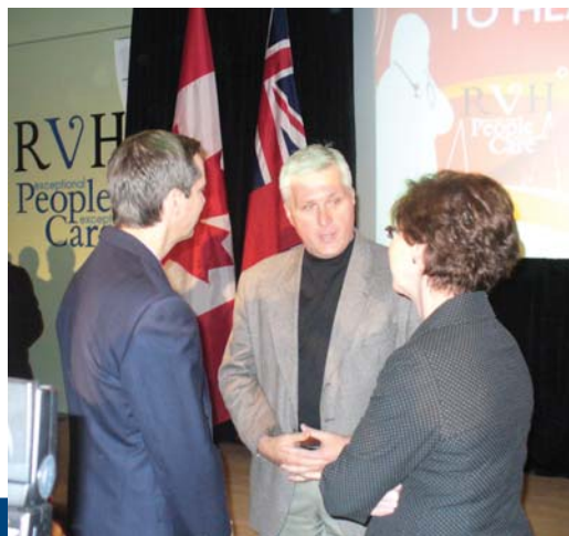
Barrie M.P.P. and Minister of Culture Aileen Carroll, Ontario Premier Dalton McGuinty and Ward 7 Councillor John Brassard at the RVH Radiation Treatment Centre opening on April 17, 2008

The City of Barrie opened the New Holly Recreation Centre in Ward 7 on January 5, 2008. This $32.5 million investment is already paying dividends by bringing City programs closer to area residents. The Holly Rec Centre is by all accounts a facility that people are proud of judging by the comments I've received